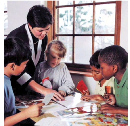
Making Cents features experiences for real learning!